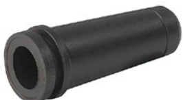
HN 14.45 PVC Strain Relief