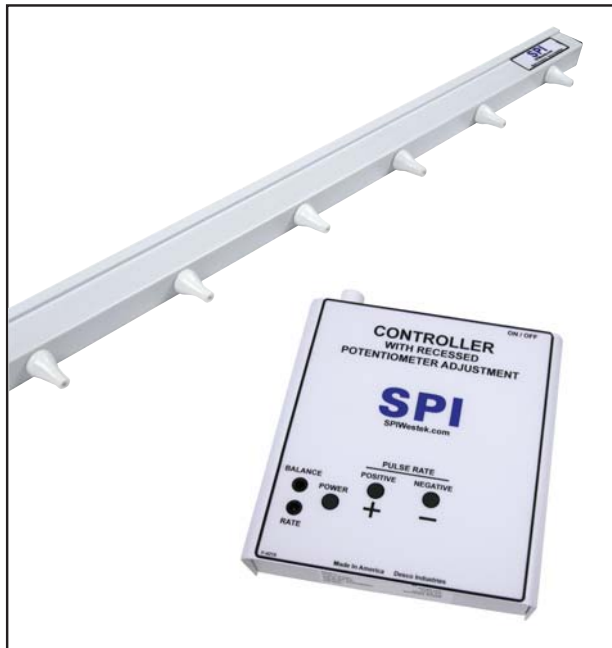
Figure 1. SPI Ion Bar and 94240 Controller